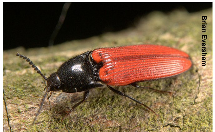
Elater (Ampedus) quercicola , Sandy Spinney Quarry, 16 th June 2012.

So it is not surprising to find a great variety of species there. A total of 1020 records were recorded for the whole event (taking into account a few weeks in May and then later in July/November). The number of records collected is very impressive. We found 713 species this year which is very close to what was found the previous years.