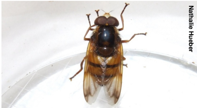
Volucella inanis – found in the office at Lings on 1st August 2012