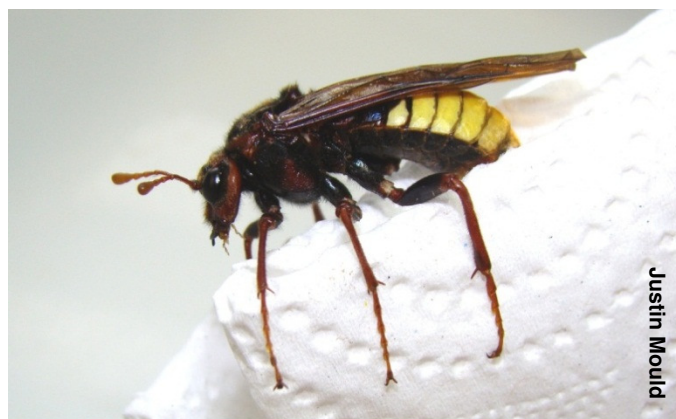
Large Alder Sawfly Cimbex connatus , Great addington gravel pit – 17 th June 2012. This is probably the first record for the county.

Overall Sandy Spinney Quarry Bioblitz was a very successful event. It would be quite interesting to repeat the event in 5 or 10 years time to compare the similarities and the differences.