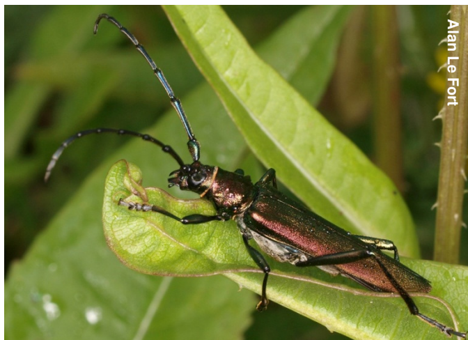
Musk beetle Aromia moschata , Abington Meadows, Northampton – 21 st June 2011. This is probably the first record for the county!

To order your copy now please contact NBRC using the details provided at the end of the Newsletter.