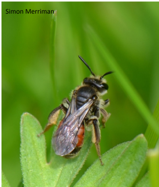
Andrena labiata Red-girdled Mining Bee